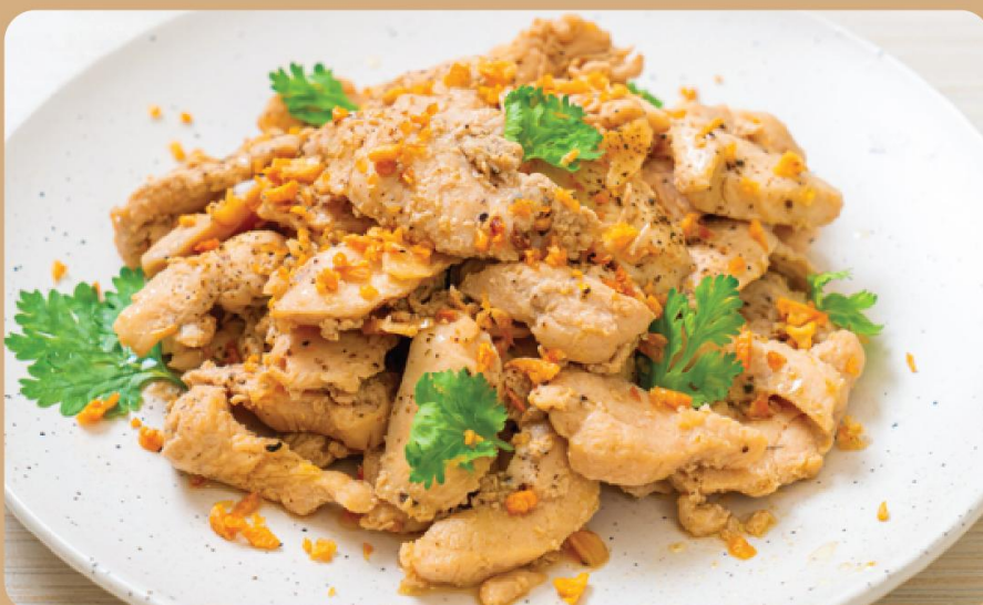
Garlic & Pepper