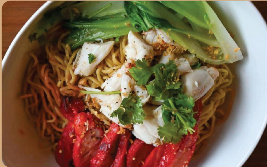
Crab Meat Egg Noodle