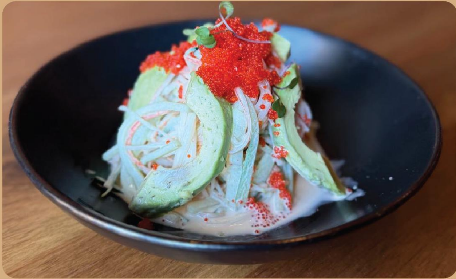
Avocado Crab Salad