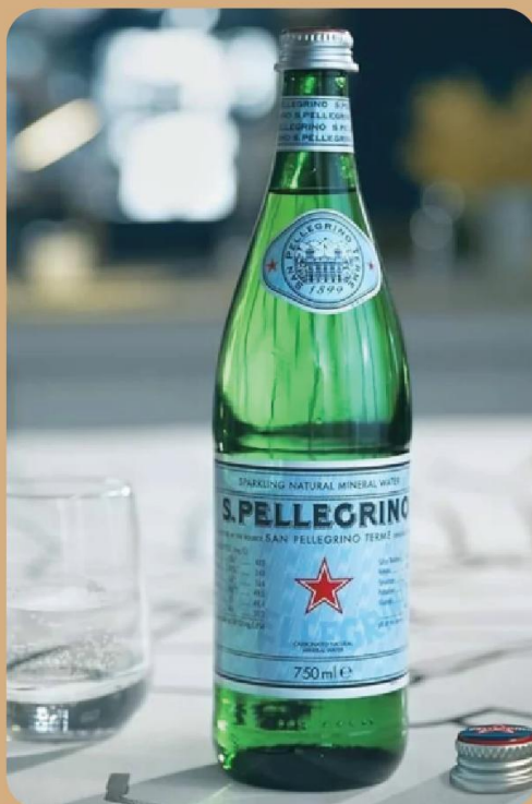
San Pellegrino Sparkling Water