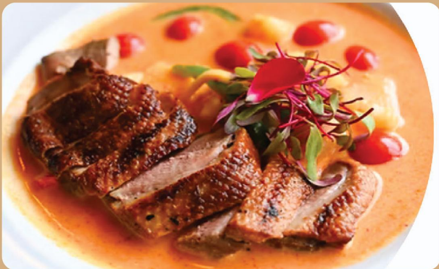
Pineapple Roasted Duck Curry