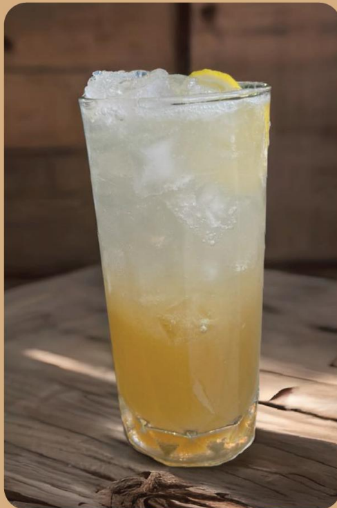
Yuzu Soda Drink