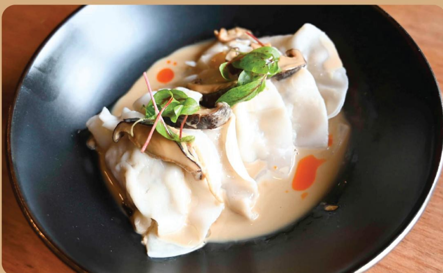
Thai Town Dumplings