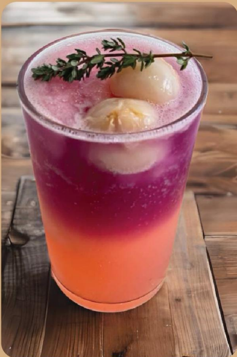
Butterfly Pea Drink