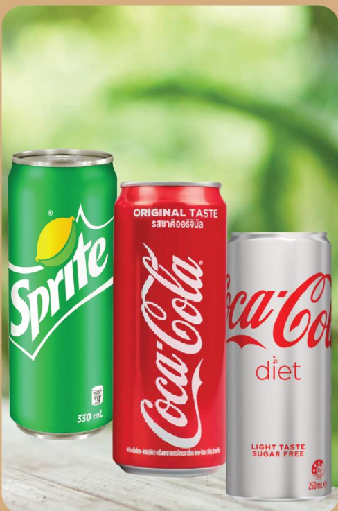
Coke, Diet Coke, Sprite