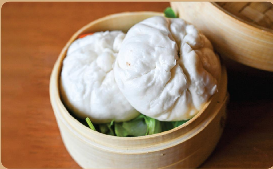
Thai Town Buns