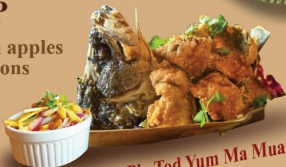
Pla Tod Yum Ma Muang

Fried filet Branzino with mango or green apples (Seasonal) salad cashew nuts and red onions with homemade dressing