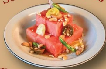
Som Tum Tangmo

Spicy watermelon salad; watermelon, string beans, crushed cashew nut in Thai anchovy chili lime dressing