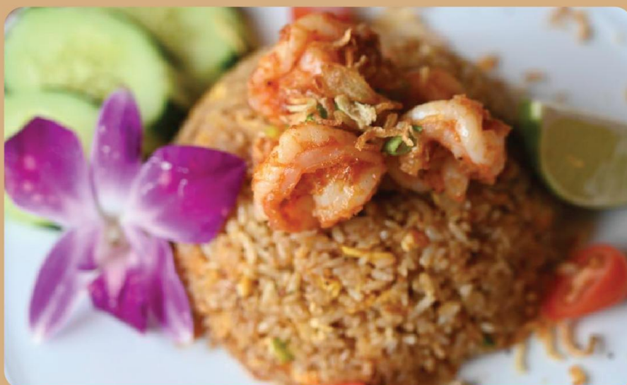
Railway Fried Rice