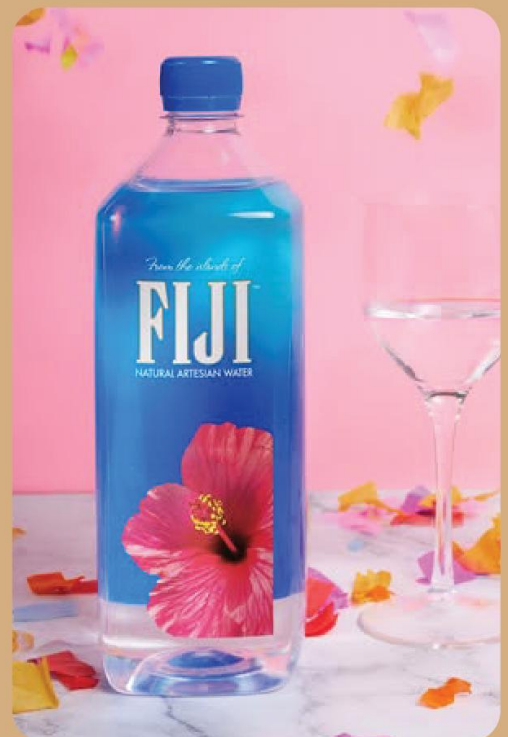
Fiji Natural Water