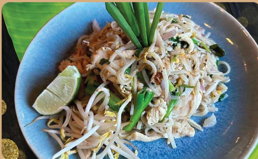
White Pad Thai