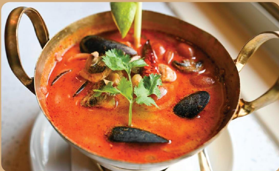
Thai Town Tom Yum