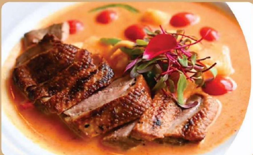
Pineapple Roasted Duck Curry