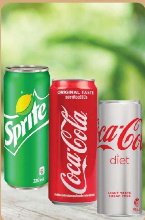
Coke, Diet Coke, Sprite