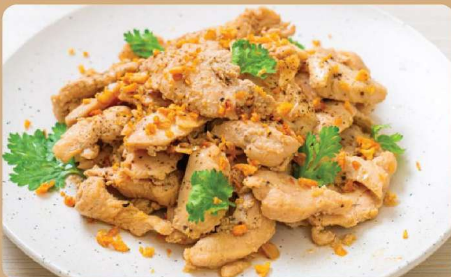
Garlic & Pepper