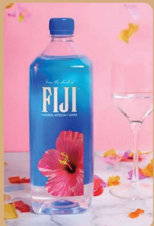
Fiji Natural Water