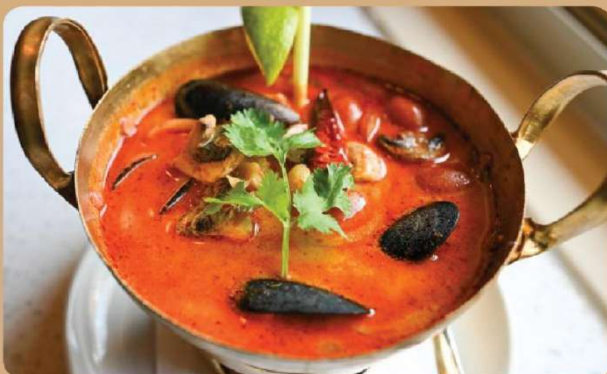
Thai Town Tom Yum