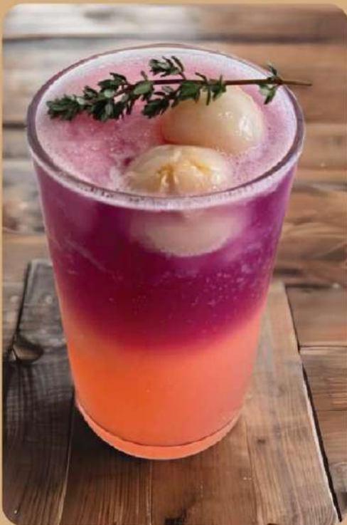
Butterfly Pea Drink