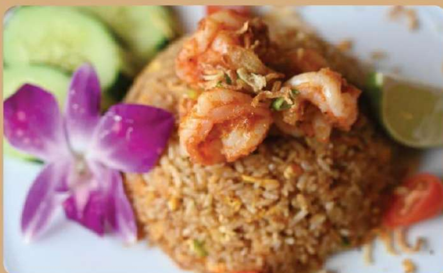
Railway Fried Rice