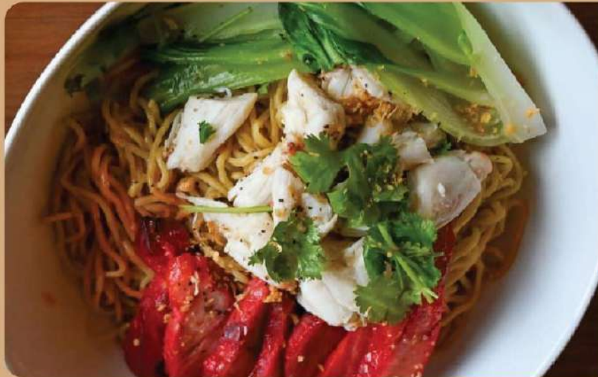
Crab Meat Egg Noodle