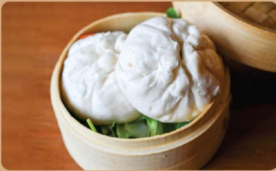
Thai Town Buns