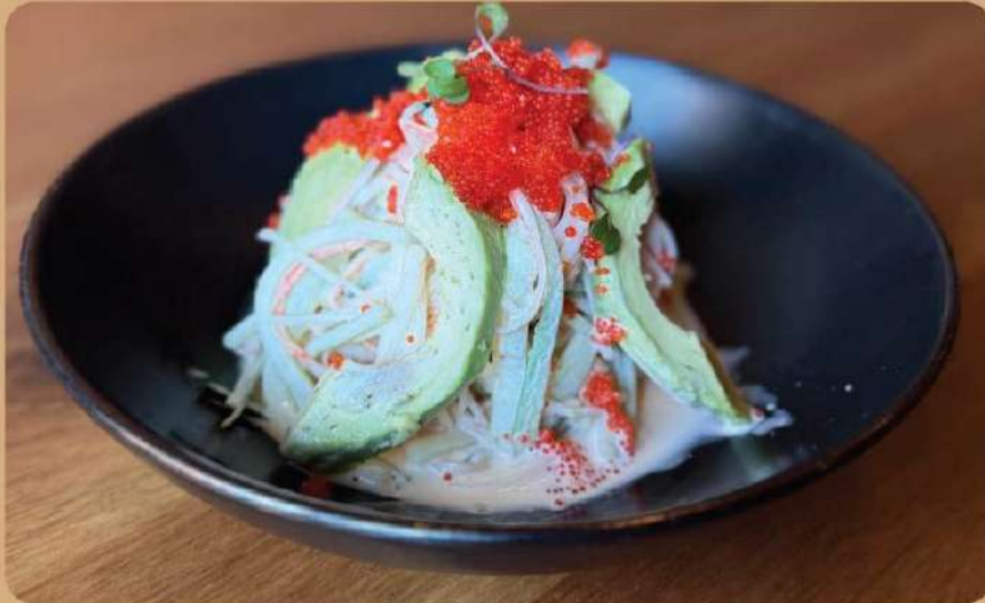
Avocado Crab Salad