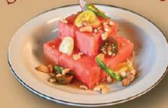
Som Tum Tangmo

Spicy watermelon salad; watermelon, string beans, crushed cashew nut in Thai anchovy chili lime dressing