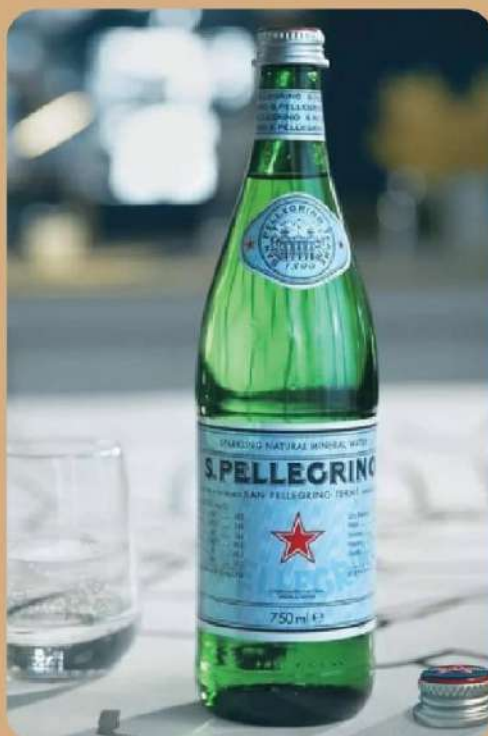
San Pellegrino Sparkling Water