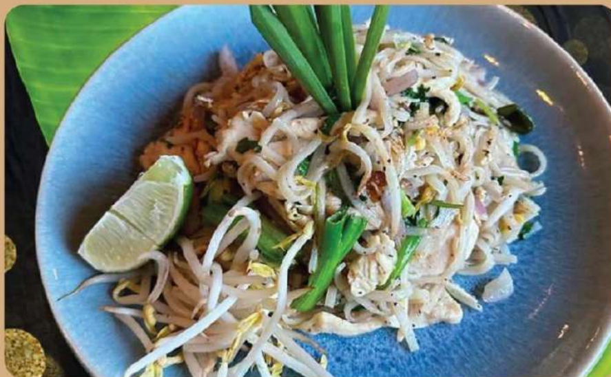
White Pad Thai