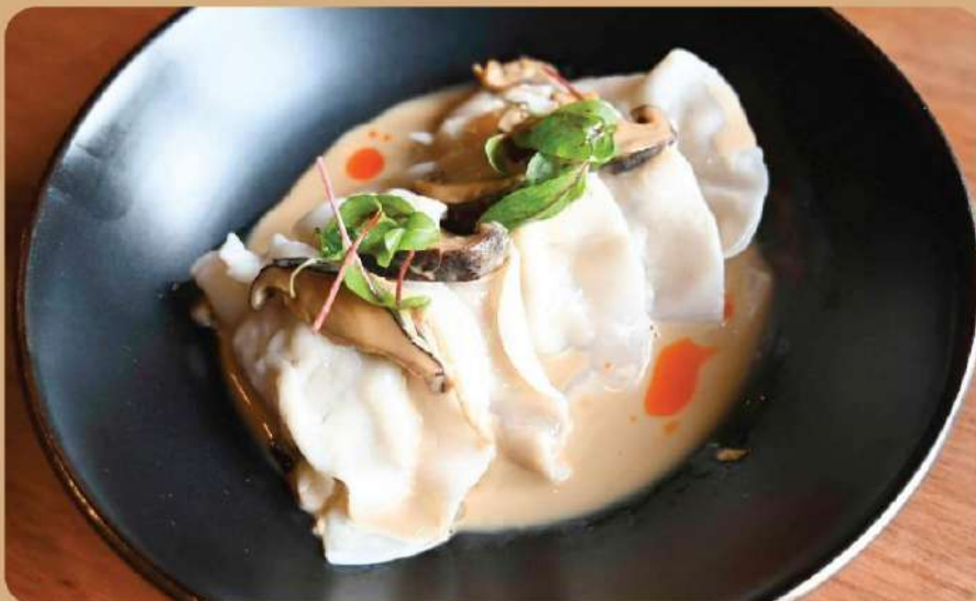
Thai Town Dumplings