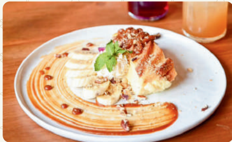
Banana Bread Pudding