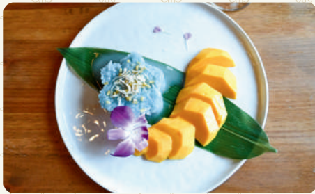
Mango Sticky Rice