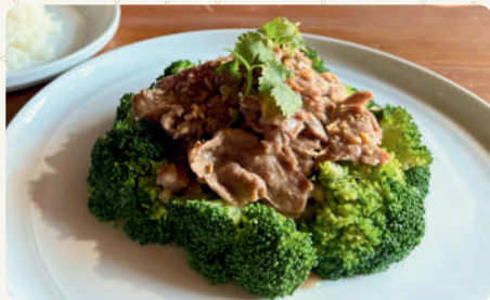
Garlic & Pepper