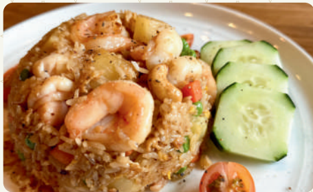
Pineapple Fried Rice