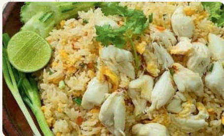
Crab Fried Rice