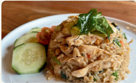
Basil Fried Rice