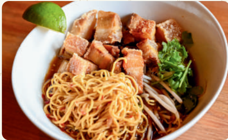
Crispy Pork Belly Noodle Soup