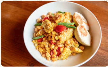
Spicy Corn Salad