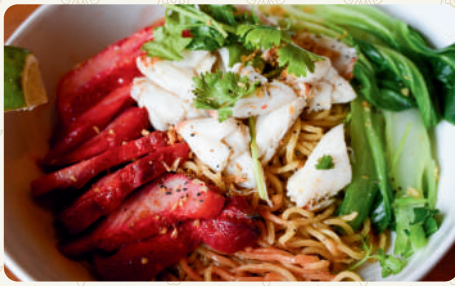
Crab Meat Egg Noodle