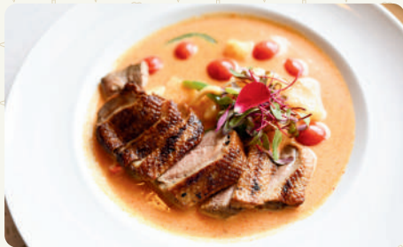
Pineapple Roasted Duck Curry