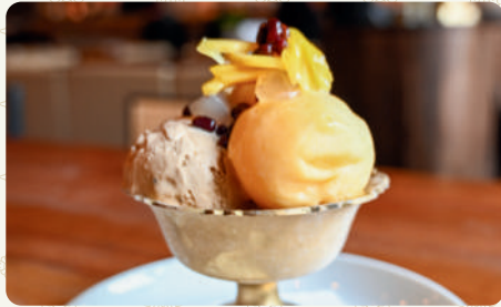
Four Season Ice Cream