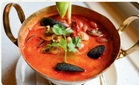
Sakhoo Seafood Tom Yum