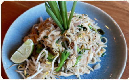
Sakhoo White Pad Thai