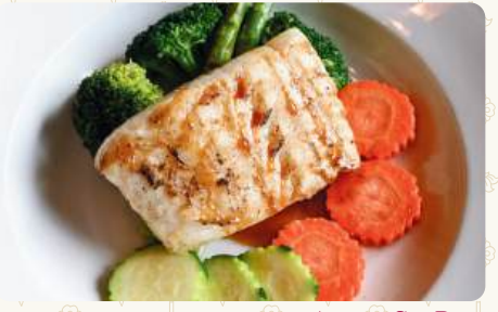
Autumn Sea Bass