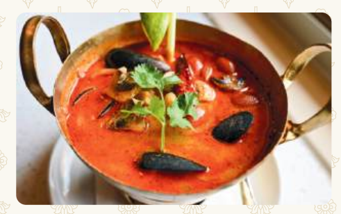
Sakhuu Seafood Tom Yum