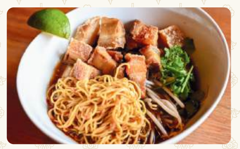
Crispy Pork Belly Noodle Soup