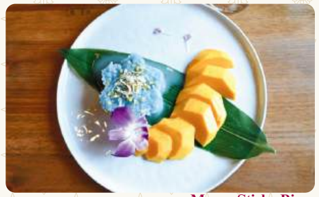
Mango Sticky Rice